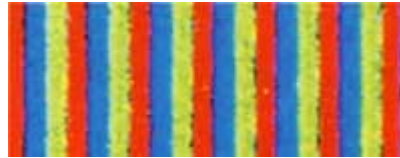
magnified CRT screen

When excited by a scanning electron beam in the CRT, the phosphors will glow momentarily until refreshed again (many times per second) forming a picture composed of colors by utilizing the red, green and blue combinations. If you look at your TV screen (while it is turned on) with a magnifying glass, you can see the colored elements. Over many years of use, the phosphors will gradually fade in brilliance and the color of your TV screen will lose its original richness.